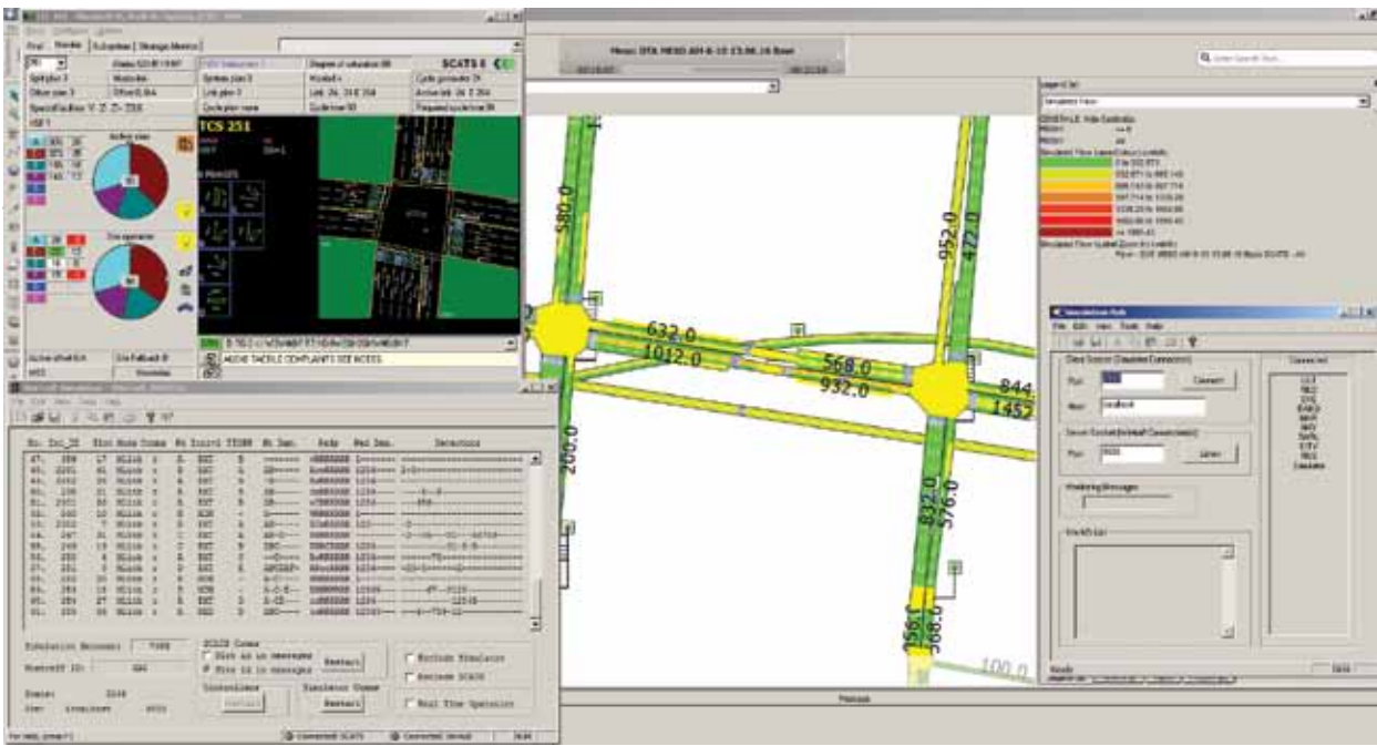
(Left) SCATSIM with Aimsun for Sydney's CBD

possible use of macroscopic-level information – e.g. to inform the dynamic model where information was unavailable, or feeding detailed dynamic model information back into the macroscopic-level model (such as updated signal timing information). To assess the impacts of the proposed light rail and new bus network, the existing condition model was edited to reflect network and operational changes – network and intersection configuration changes as well as traffic signal updates (58 intersections). The model introduced dedicated light rail vehicles with specific vehicle characteristics, service frequencies, stop locations and dwell times. To ensure accurate assessment not only of the impact of the final design but also the impact of closing lanes or streets for roadworks during the construction period, the team modeled different time periods (AM, daytime and PM). This was achieved in a single model along with current and future demand and supply scenarios for the light rail and bus services in addition to general vehicle traffic,